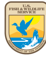
U.S. Fish and Wildlife Service