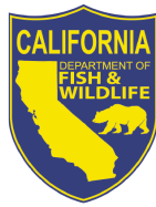
California Department of Fish and Wildlife