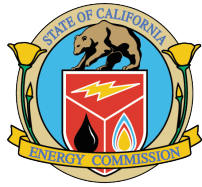
California Energy Commission